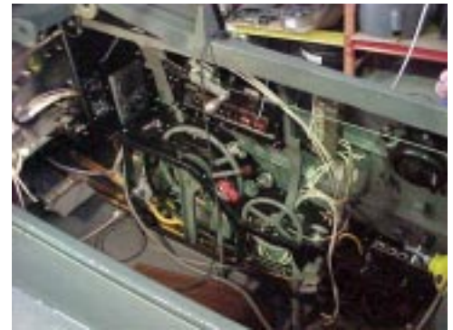
Wiring in cockpit in progress

All the control surfaces are structurally complete and have been trial fitted. They are now being covered and painted and should be ready mid January.