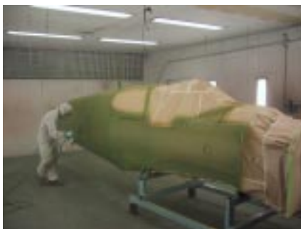
Fuse in paint shop

The engine has arrived and has been fitted. Most of the interior is fitted out with only the panel and items that need the wings on to finish, need completing.