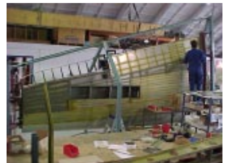
RH wing finished

The windscreen is on, the canopy complete and internally painted. The fuse is in the paint shop this week and should be out next week ready for final fit on tail feathers, etc.