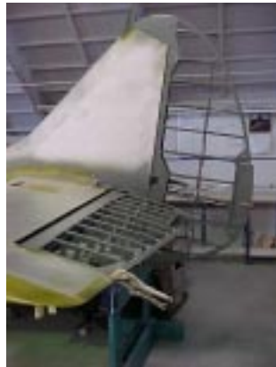
Elevators & Rudder