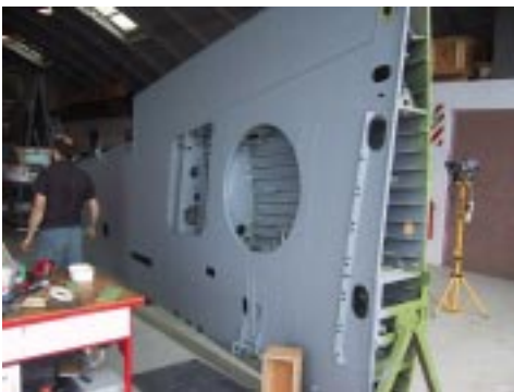
LH Wing painted

The LH wing has been fitted out, the leg and brake is finished and the paint's on.