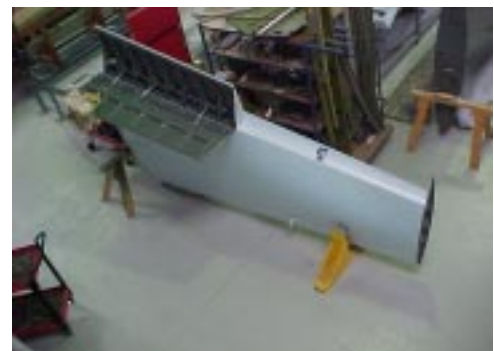
Wing ready to fit

Both wings are finished, flaps and fuel tanks fitted, and painted and ready to fit.