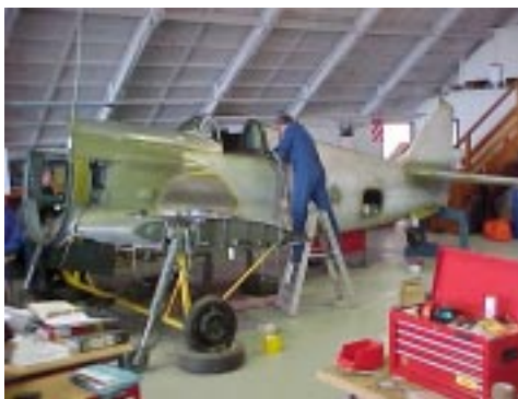
Front cowls being fitted

The front cowls are almost completely serviced and ready to go. Some of this stuff is really agricultural in its original condition and we may just have to go back and "westernise" it a bit. We'll do it before Wanaka if we have time - after Wanaka if we don't.