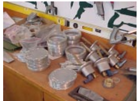
Fuel tank fittings

While we are waiting for the stringer we have been completing more wing components and most items, except skins, back to Spar #5 are now ready for assembly.