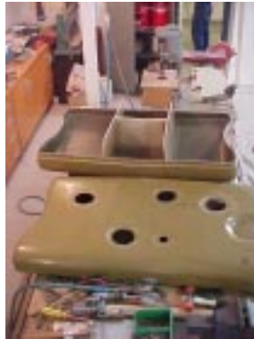
Fuel tank shells