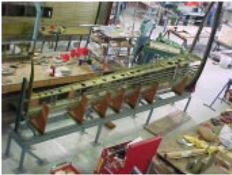
RH wing to Spar #3

Jerry Yagen's P-40E is also progressing. The RH wing is built up to #3 spar, just awaiting the arrival of stringer to complete this section. It will be going straight into the main wing jig as soon as we get the stringer.